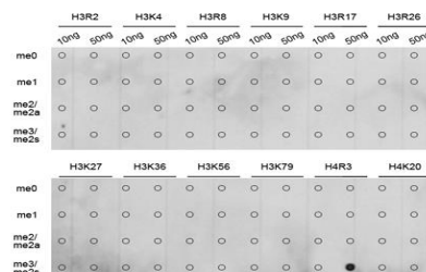
Dot-blot analysis of all sorts of methylation peptides using Histone H4 (sDi-Methyl R3) antibody.